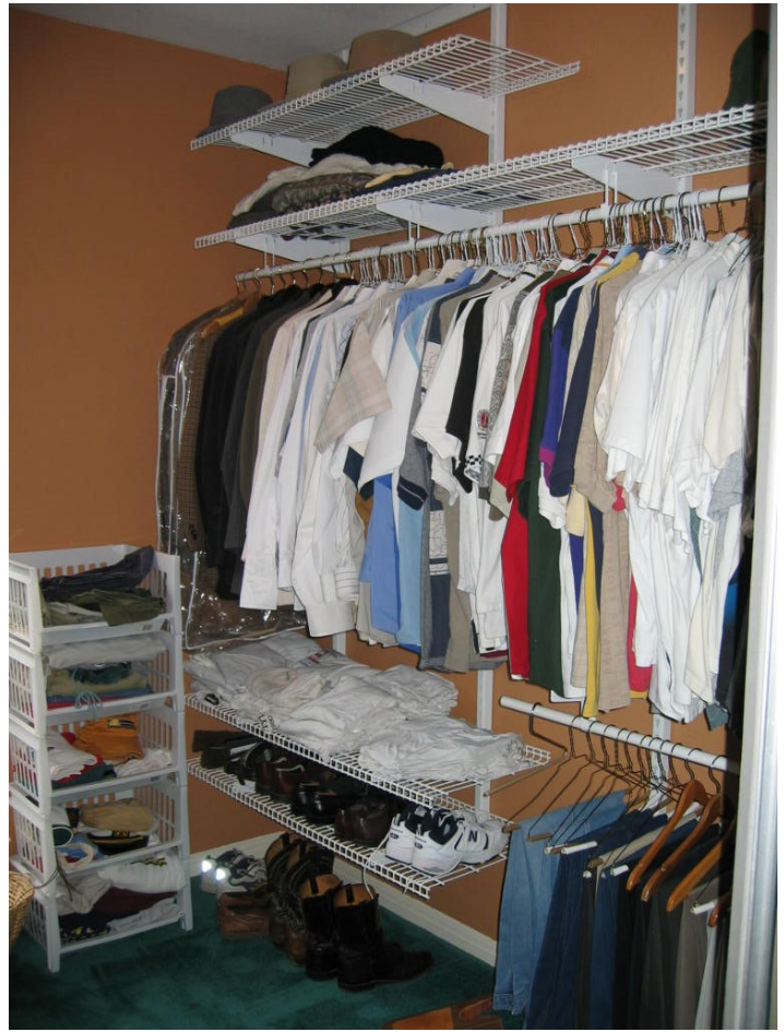
Short Wall trimmed 48" top rail, verticals & shelves adjusted to go around obstacles